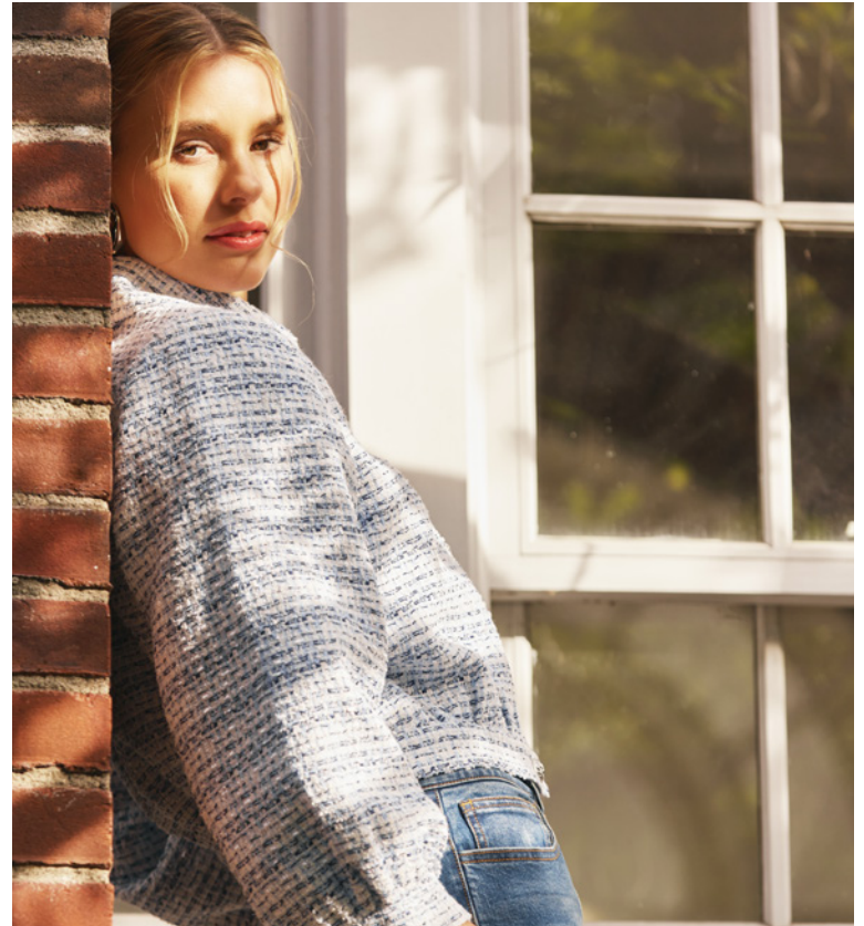
Dana Pleat Shirt 32017CC-LBL Cara Fortuni Skirt 51102CC-MLT