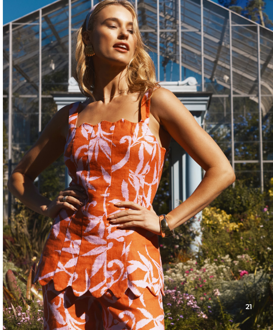
Gianna Linen Orchid Pants 62102CC-MLT