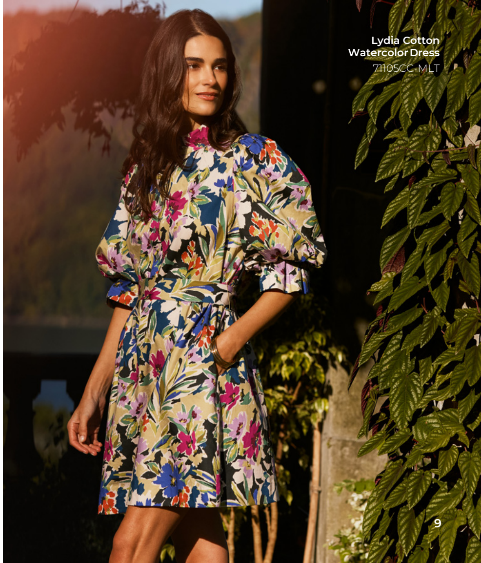
Lydia Cotton Watercolor Dress 71105CC-MLT