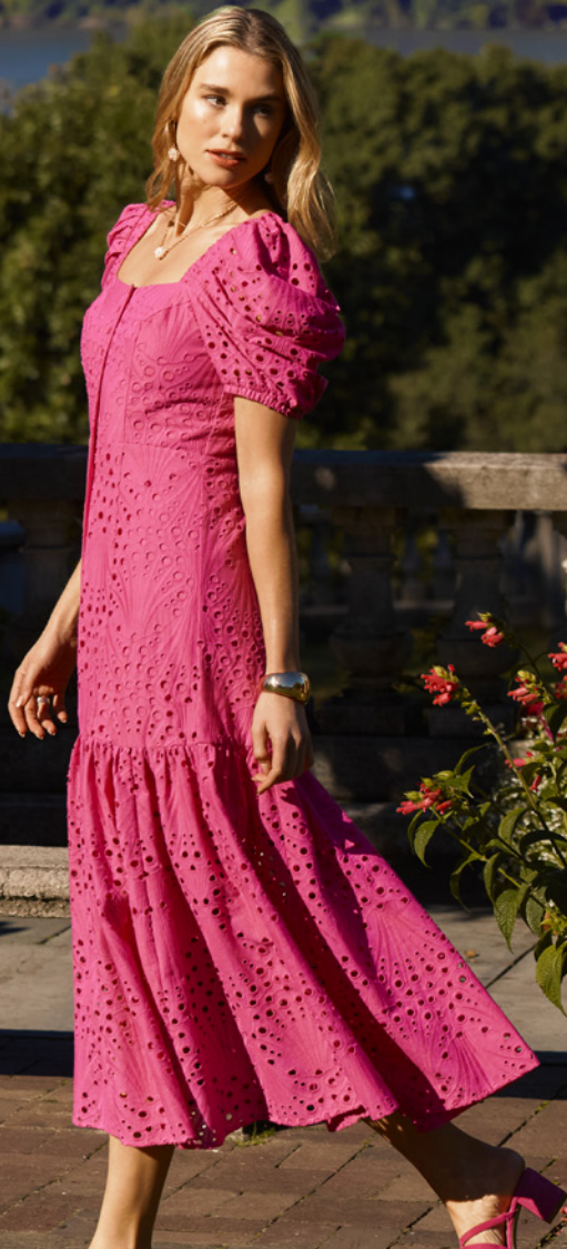
Cleo Eyelet Midi Dress 71300CC-HTP