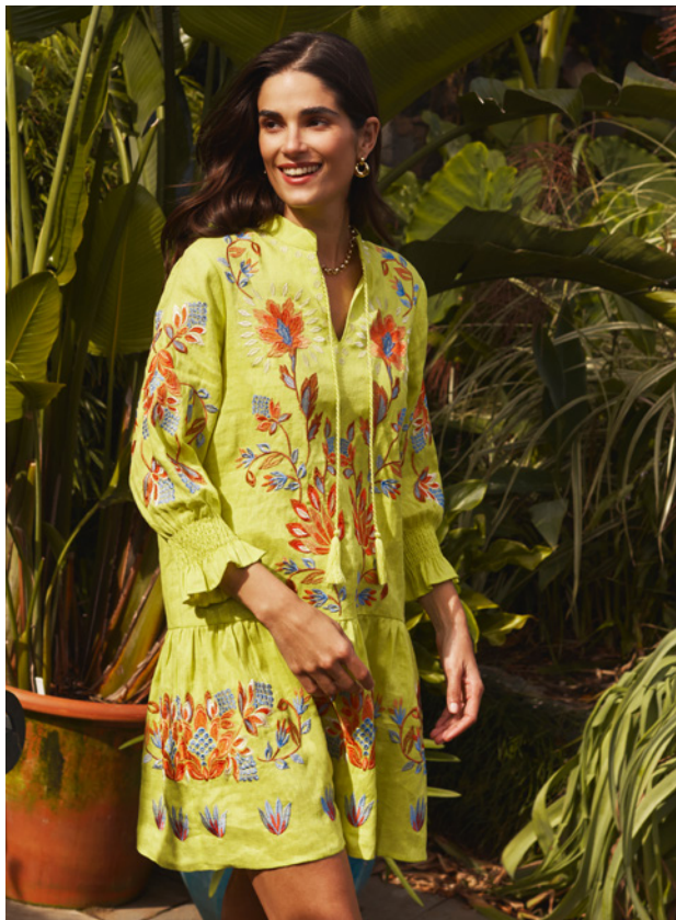
Nikki Linen Dress 32134CC-WLM Penny Eyelet Tunic 32300CC-WLM