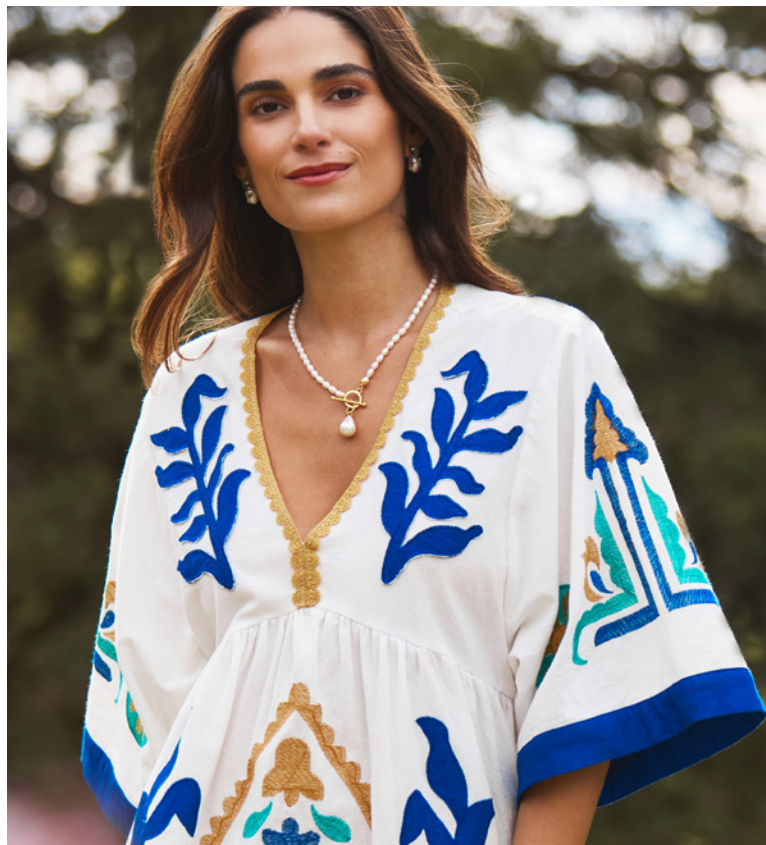
Amelia Chambray Dress