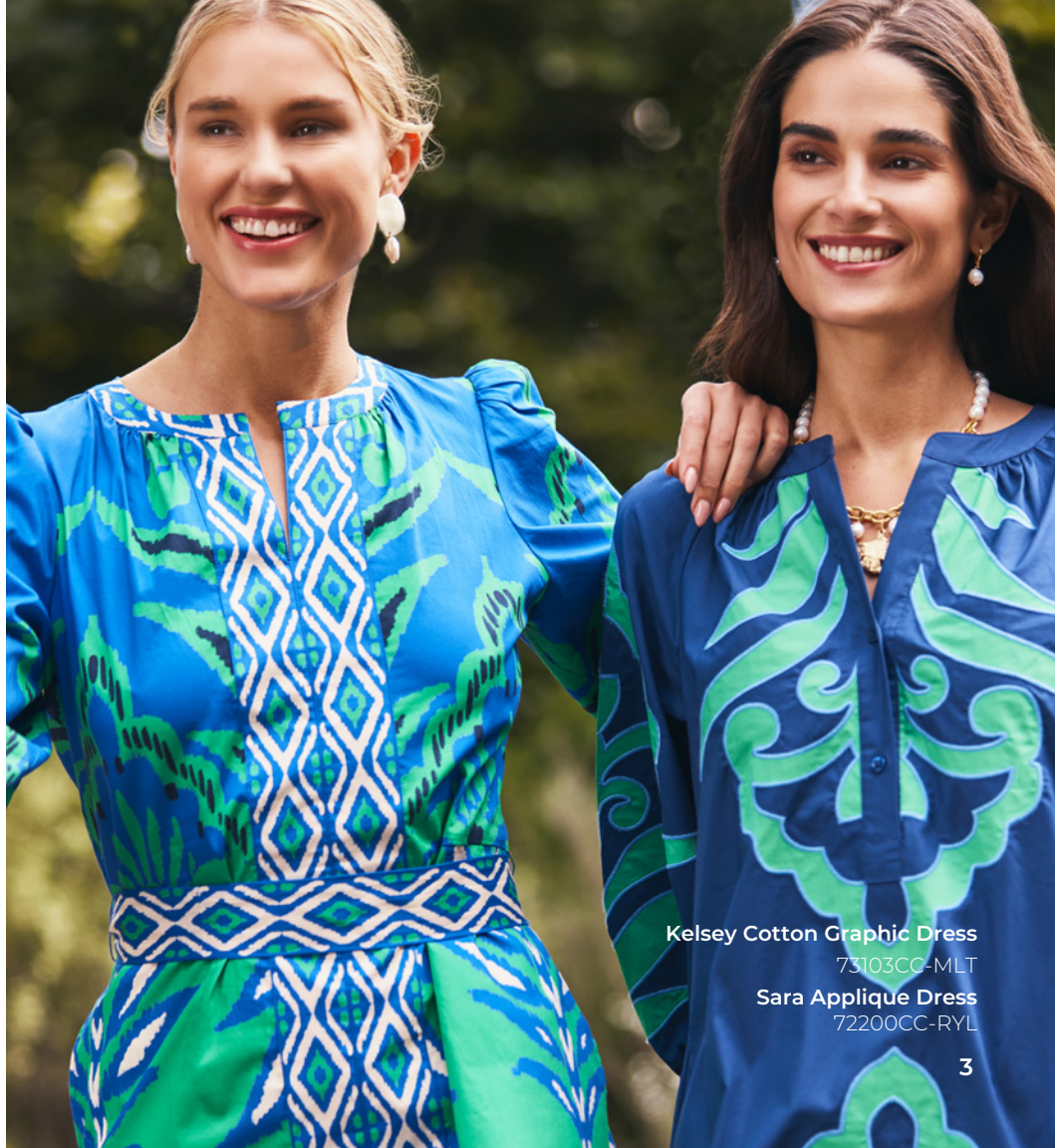
Kelsey Cotton Graphic Dress